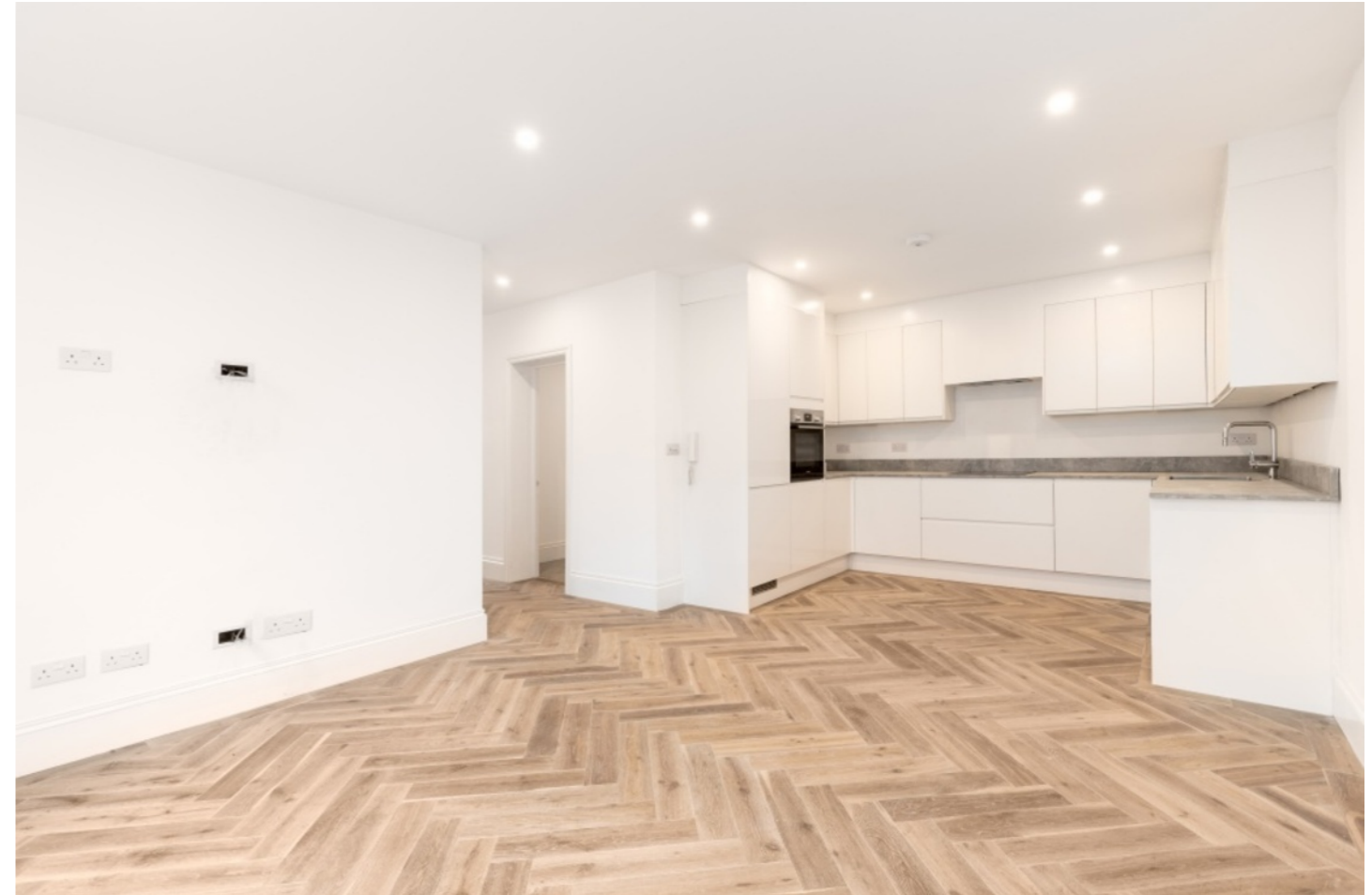
JEDDO ROAD W12 • ASKEW ROAD AREA £650,000 SHARE OF FREEHOLD

Floor Plan produced for Philip Wooller by Mays Floorplans © . Tel 020 3397 4594 Illustration for identification purposes only, not to scale All measurements are maximum, and include wardrobes and window bays where applicable