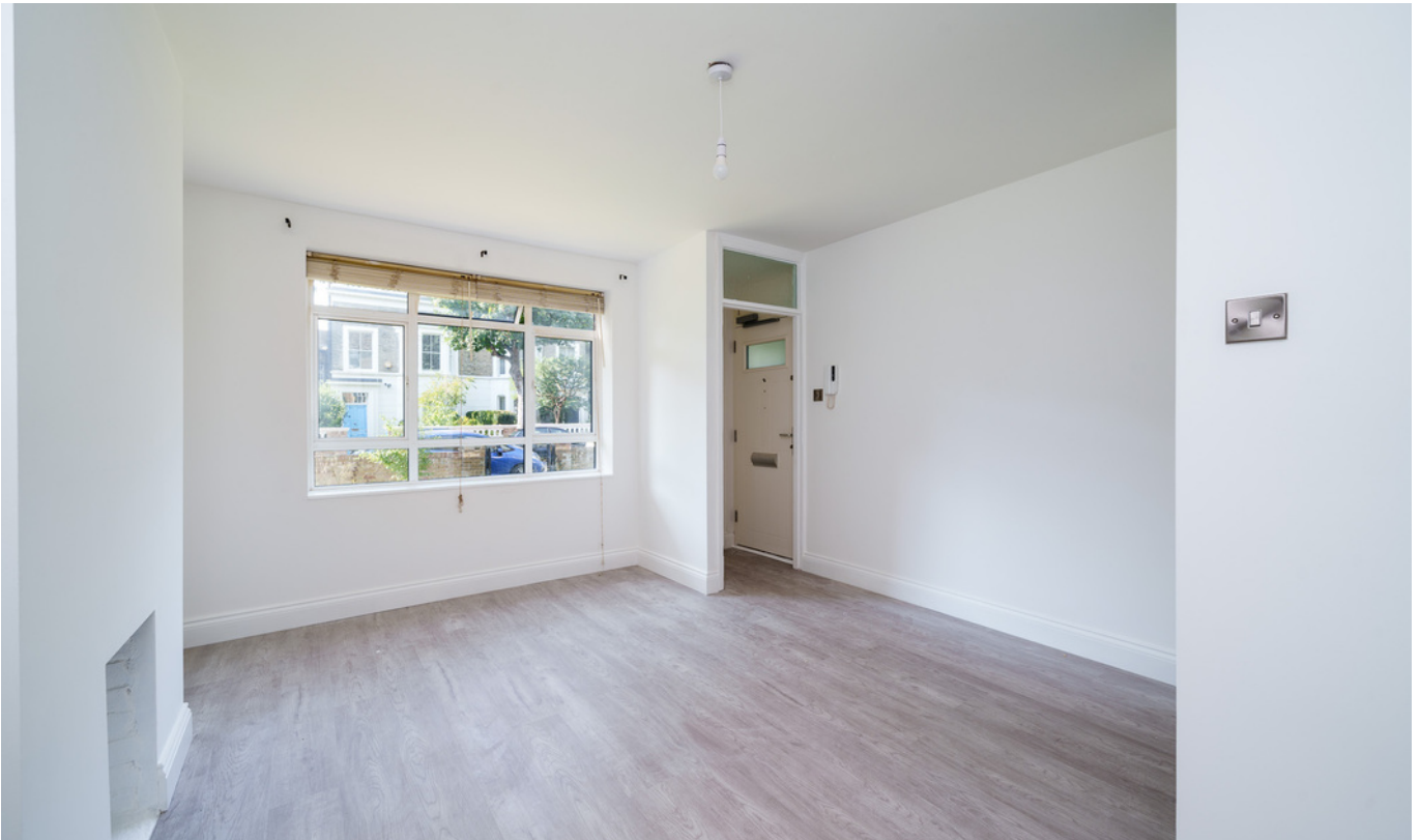
ASHCHURCH PARK VILLAS W12 • RAVENCOURT PARK £320 PW / £1386 PCM