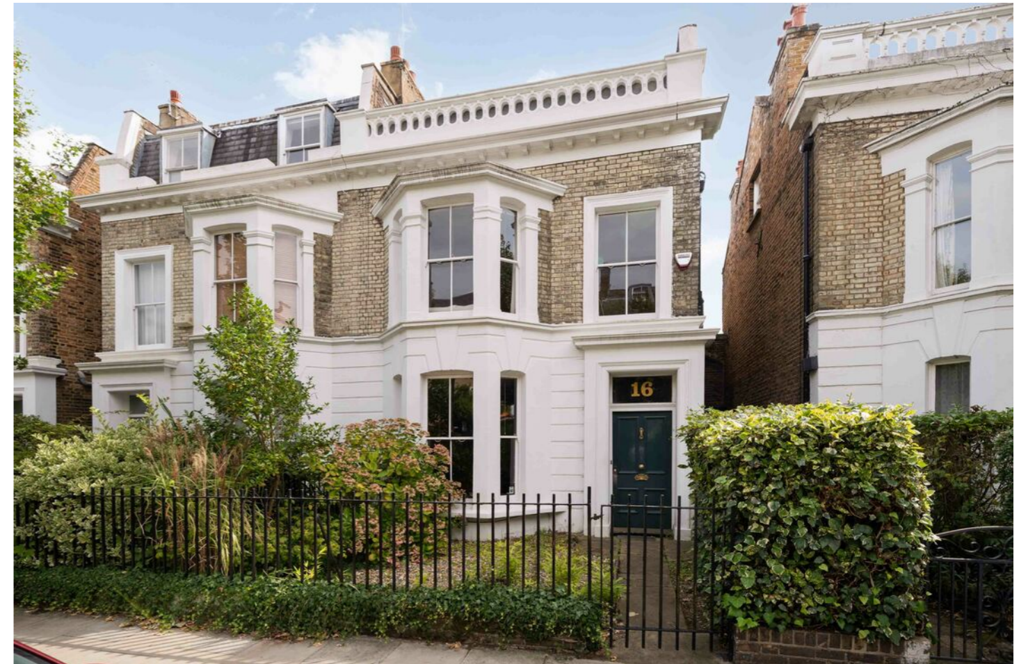
ASHCHURCH TERRACE W12 • ASHCHURCH AREA GUIDE PRICE £2,000,000 FREEHOLD