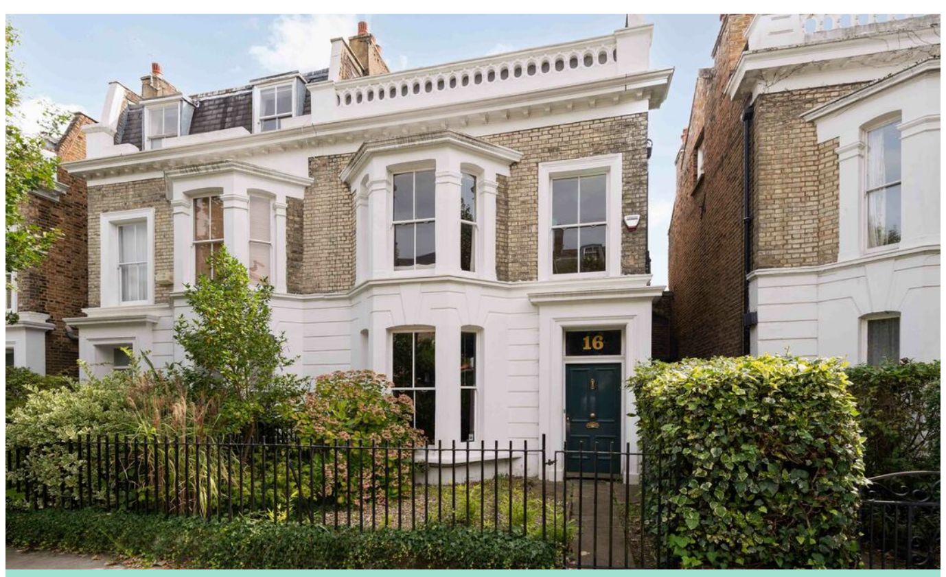
ASHCHURCH TERRACE W12 · ASHCHURCH AREA GUIDE PRICE £2,000,000 FREEHOLD