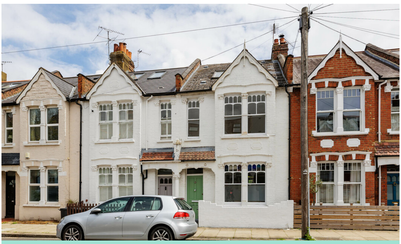
THORPEBANK ROAD W12 • SHEPHERD'S BUSH £835,000 FREEHOLD