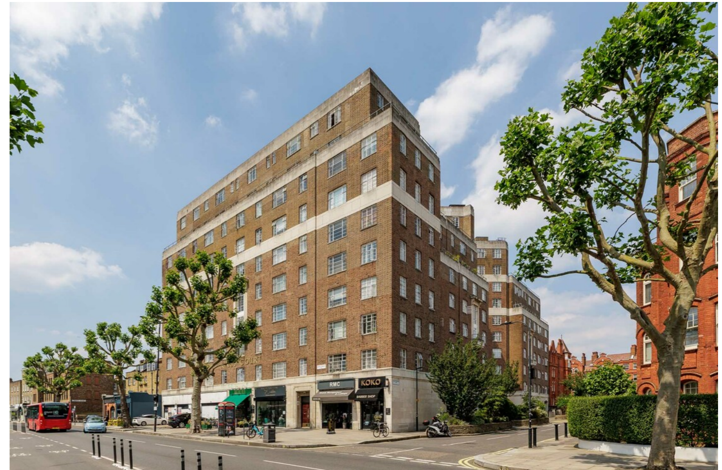
KINGS COURT, HAMLET GARDENS W6 • RAVENSCOURT PARK £250,000 LEASEHOLD

All measurements are maximum, and include wardrobes and window bays where applicable