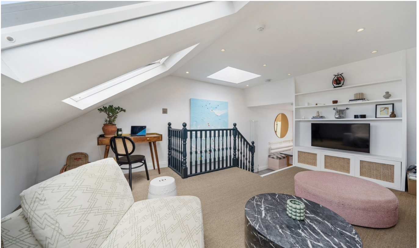
OAKLANDS GROVE W12 • SHEPHERD'S BUSH £910,000 SHARE OF FREEHOLD