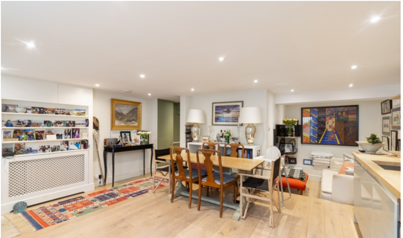
MELINA ROAD W12 • ASKEW ROAD AREA £565,000 SHARE OF FREEHOLD