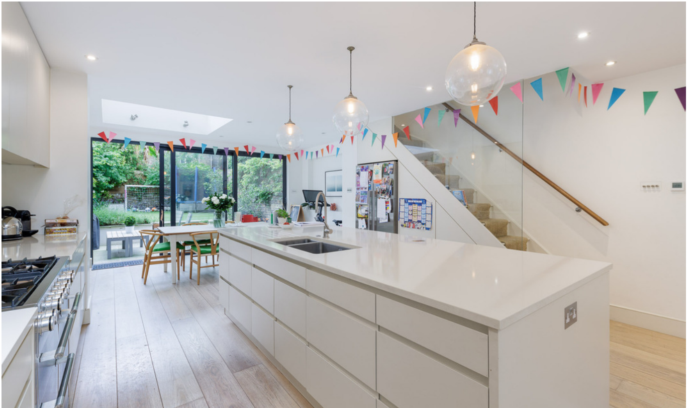
CATHNOR ROAD W12 • RAVENSCOURT PARK £1,850,000 FREEHOLD