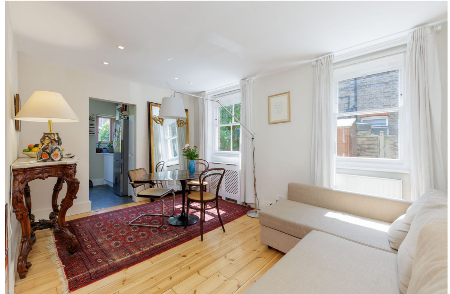
AYLMER ROAD W12 • WENDELL PARK £625,000 LEASEHOLD