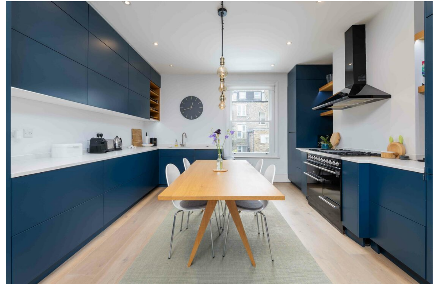
WENDELL ROAD W12 • WENDELL PARK £975,000 SHARE OF FREEHOLD

Floor Plan produced for Philip Wooller by Mays Floorplans © . Tel 020 3397 4594 Illustration for identification purposes only, not to scale All measurements are maximum, and include wardrobes and window bays where applicable