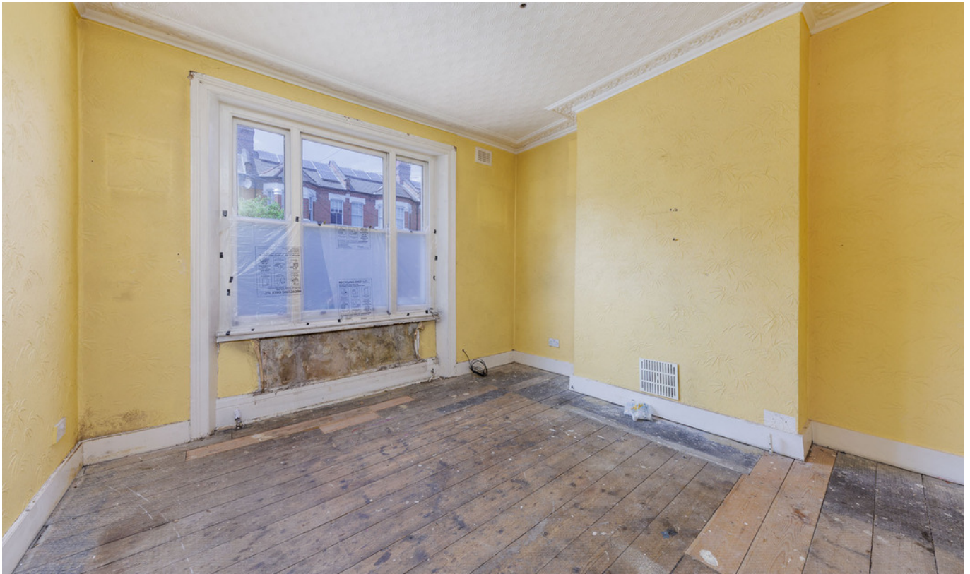
CURWEN ROAD W12 • ASKEW ROAD AREA £495,000 LEASEHOLD