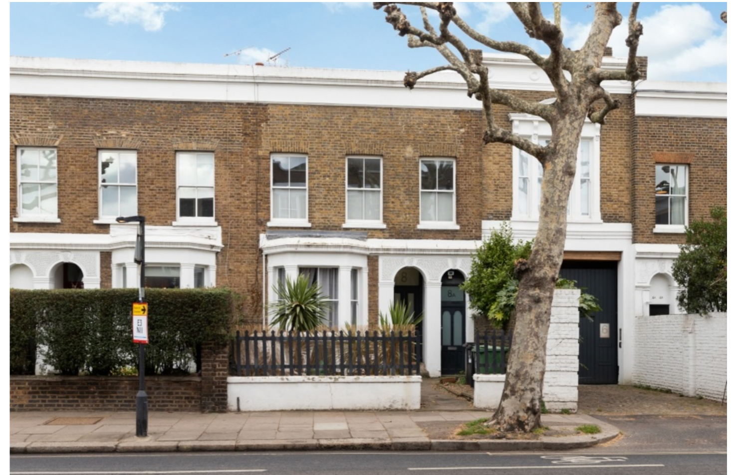
STAMFORD BROOK ROAD W6 • STAMFORD BROOK £280 PW / £1213 PCM

All measurements are maximum, and include wardrobes and window bays where applicable