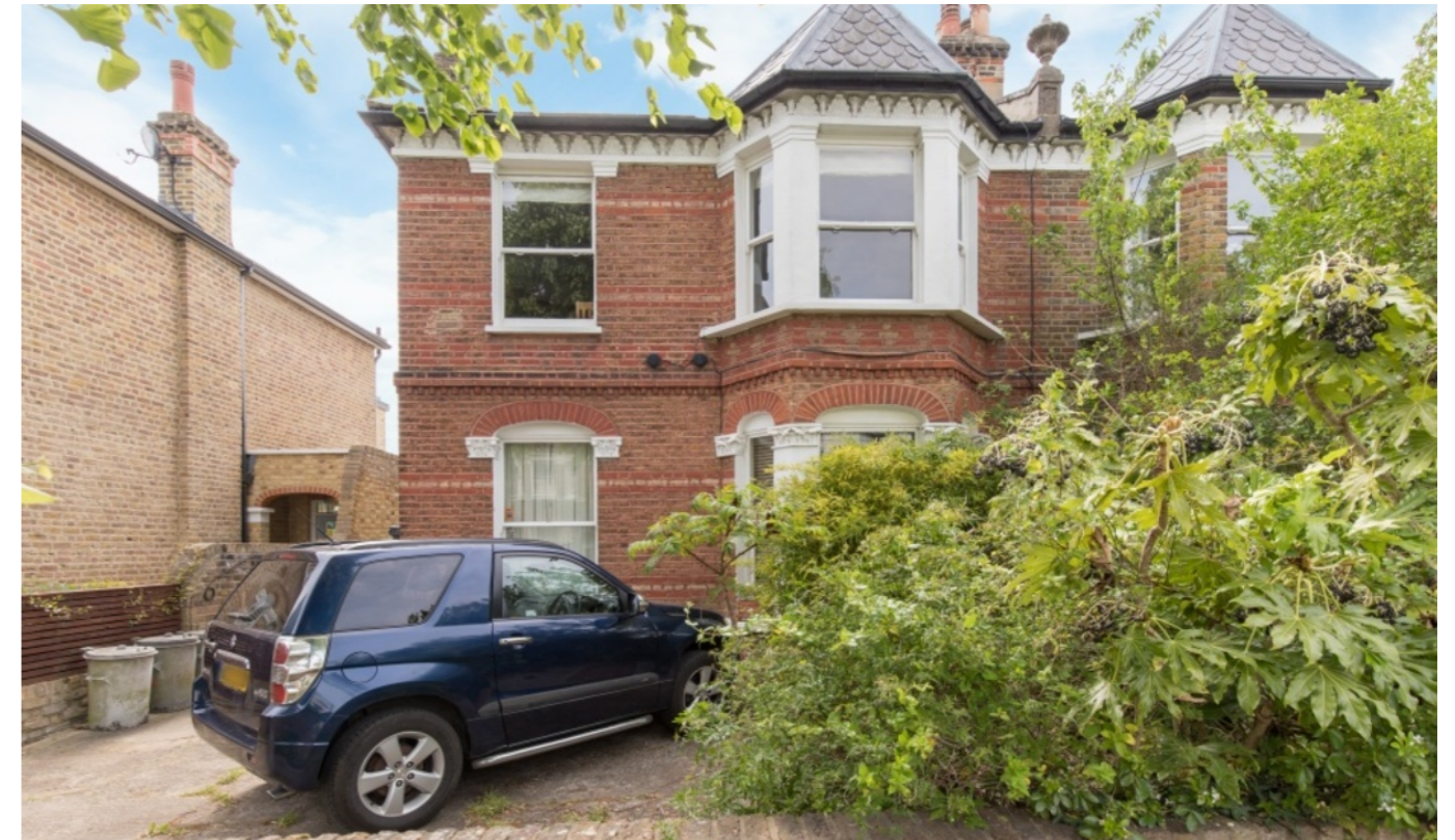
RYLETT ROAD W12 • WENDELL PARK £315,000 LEASEHOLD

All measurements are maximum, and include wardrobes and window bays where applicable