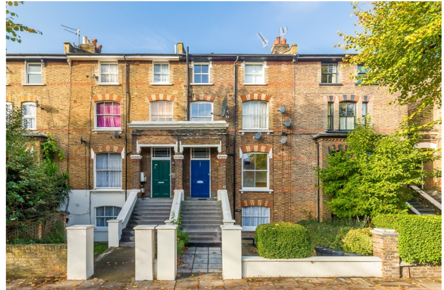
CONINGHAM ROAD W12 • SHEPHERD'S BUSH WEEKLY RENTAL OF £375

Floor Plan produced for Philip Wooller by Mays Floorplans © . Tel 020 3397 4594