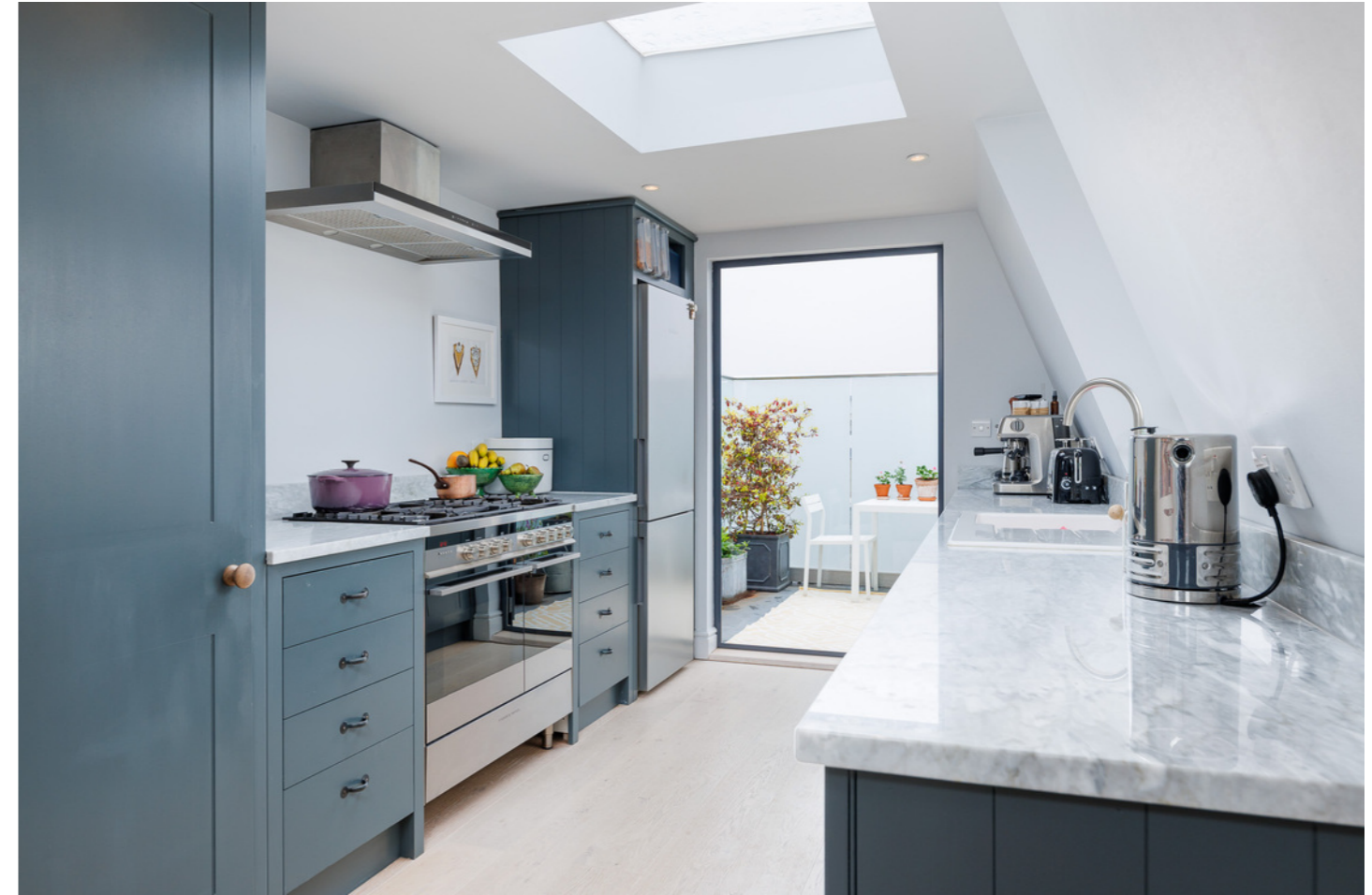
PERCY ROAD W12 • ASKEW ROAD AREA £850,000 SHARE OF FREEHOLD

Floor Plan produced for Philip Wooller by Mays Floorplans © . Tel 020 3397 4594 Illustration for identification purposes only, not to scale All measurements are maximum, and include wardrobes and window bays where applicable