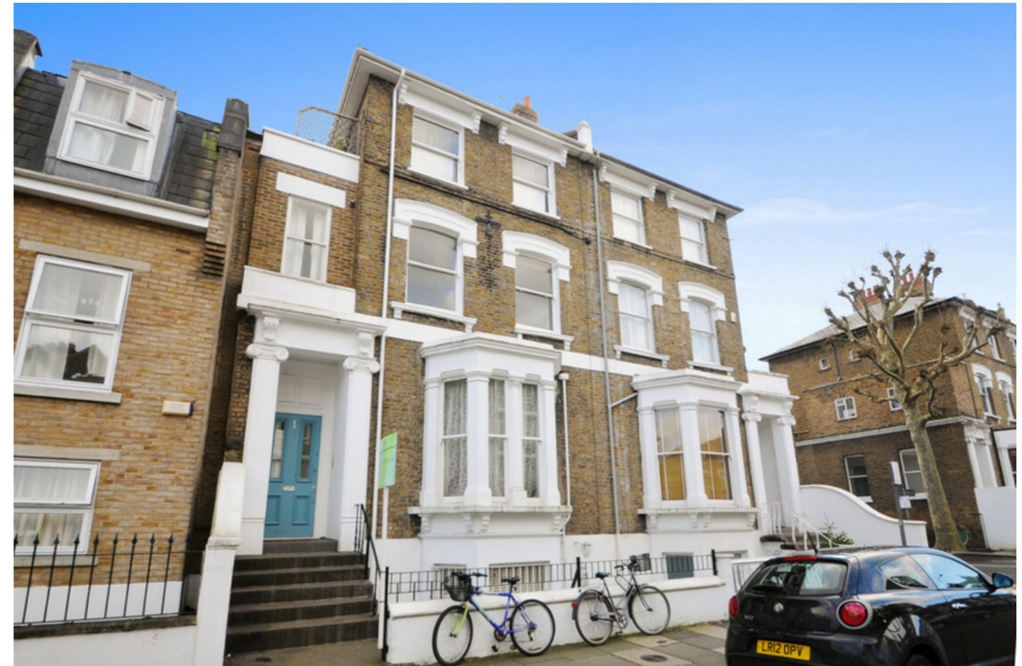
BENBOW ROAD W6 • BRACKENBURY VILLAGE £490 PW / £2123 PCM