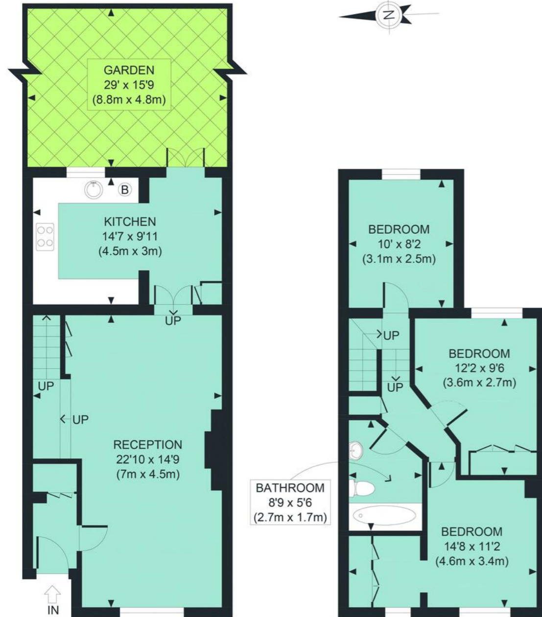
GROUND FLOOR GROSS INTERNAL FLOOR AREA 484 SQ FT