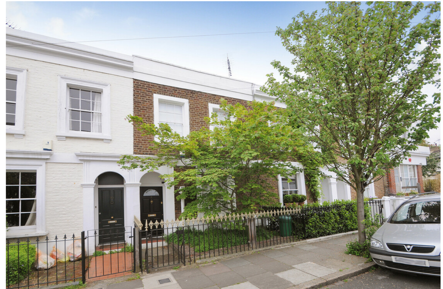
PERRERS ROAD W6 • BRACKENBURY VILLAGE £850 PW / 3,683 PCM